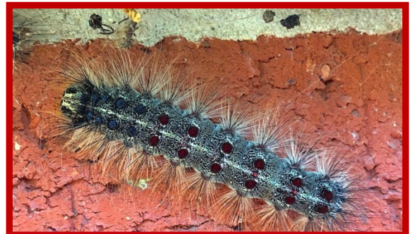
A spongy moth caterpillar.

Plants Attacked and Damage: Spongy moth caterpillars have been reported to feed on hundreds of species of trees and shrubs. Preferred hosts include aspen, birch, crabapple, hawthorn, linden, mountain ash, oak, and willow. Some deciduous trees (e.g., dogwood, green & white ash, honey locust, silver & red maple, and tulip tree) and most evergreen trees are generally resistant. Blue spruce and white pine can occasionally be attacked. Feeding damage frequently results in severe and/or complete defoliation which can weaken trees over time. On rare occasions, trees can be killed outright. In most cases, trees recover and produce new leaves in July.