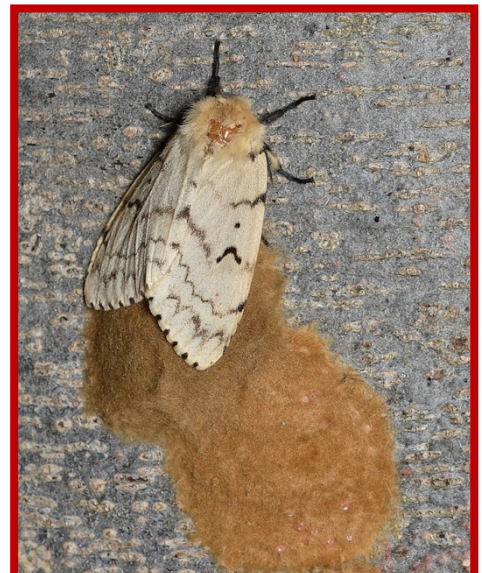
Adult female spongy moth with egg mass.