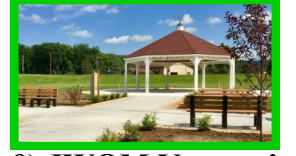
9) JWOM Veteran's Memorial Pavillion 1100 N. Jefferson St.