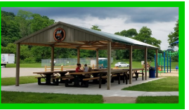
12) RC '68 Hornet Hive 600 W.Seminary St.