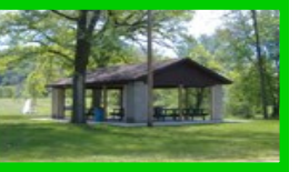
6) B.I. Pippin 1100 N. Jefferson St.