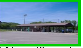
8) Lions w/Concession 1340 Allison Park Dr.