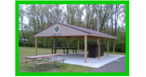
11) Carl Chellevold 23595 WI Trunk 80 N.