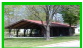
2) Eunice Keepers 200 W. 8th St.